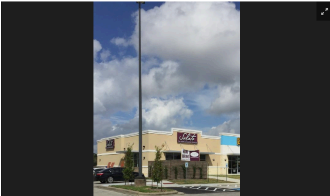
Salata is slated to open its first Beaumont location on March 29.

The Houston Chronicle reports the store is 2,500 square feet and has seating for 80 guests.