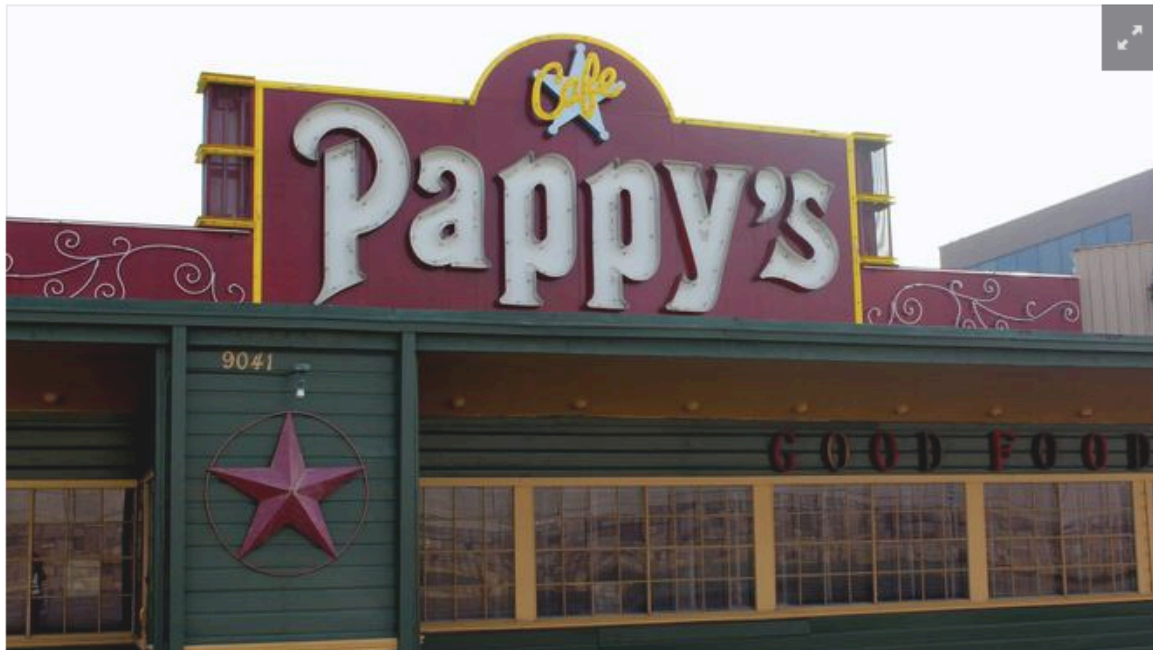
After 34 years at its 9041 Katy Freeway location, Pappy's Café is moving.

Pappy's Café will serve its last meal at 9041 Katy Freeway on March 31, and it will reopen at 12313 Katy Freeway near Dairy Ashford Road on April 5, according to a press release.